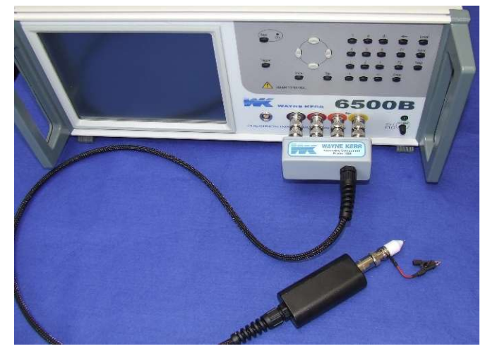
1J1025 Probe ready for use